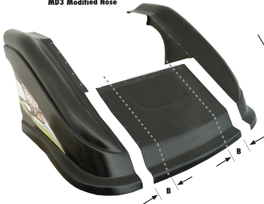
MD3 Modified Nose

Thank you for purchasing our new MD3 Mod Nose. Here are some tips on how to custom fit the center of your new nose.